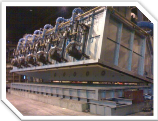
Fig.1 Clam furnace opening (15°)