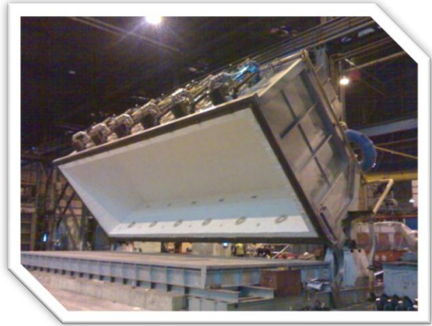
Fig. 2 Clam furnace opening (60°)