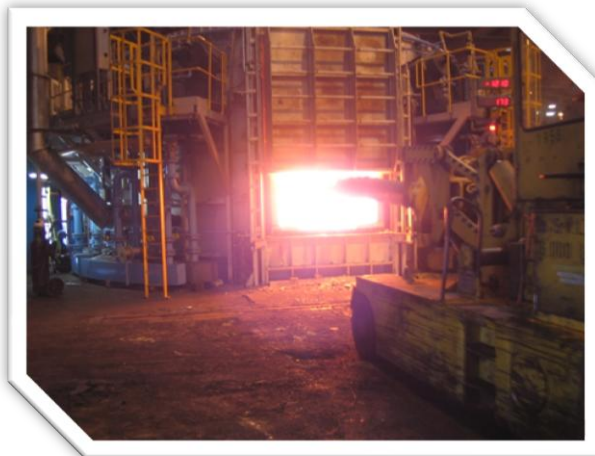
Fig. 4 Rotary hearth furnace being charged