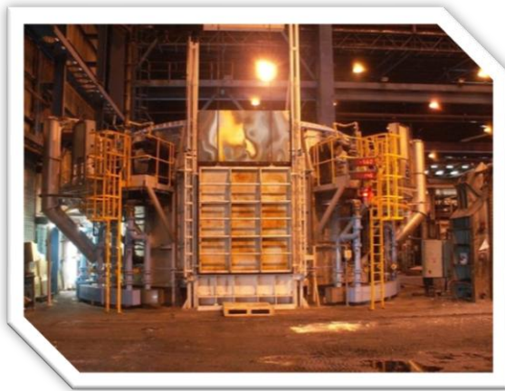
Fig.2 Rotary hearth furnace with the door closed