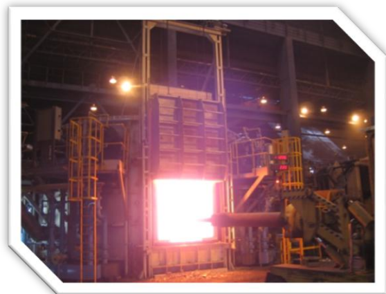
Fig. 3 Rotary hearth furnace being charged